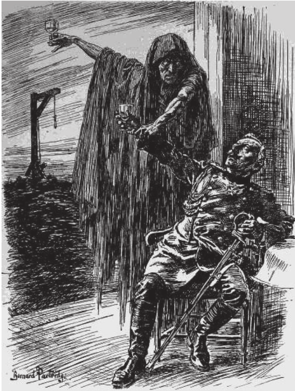
A cartoon published in Britain in 1915. The Kaiser is saying 'To the Day...', but the figure of Death adds the words '...of reckoning!'