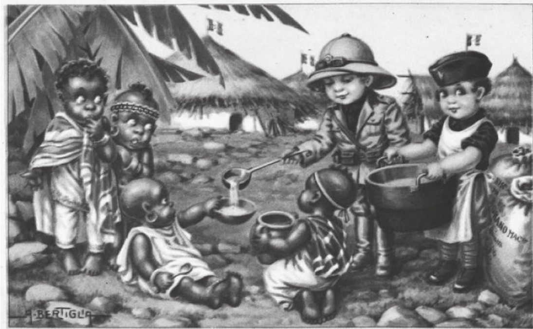
A postcard published in Italy in 1936 showing Italian and Abyssinian children in Abyssinia.