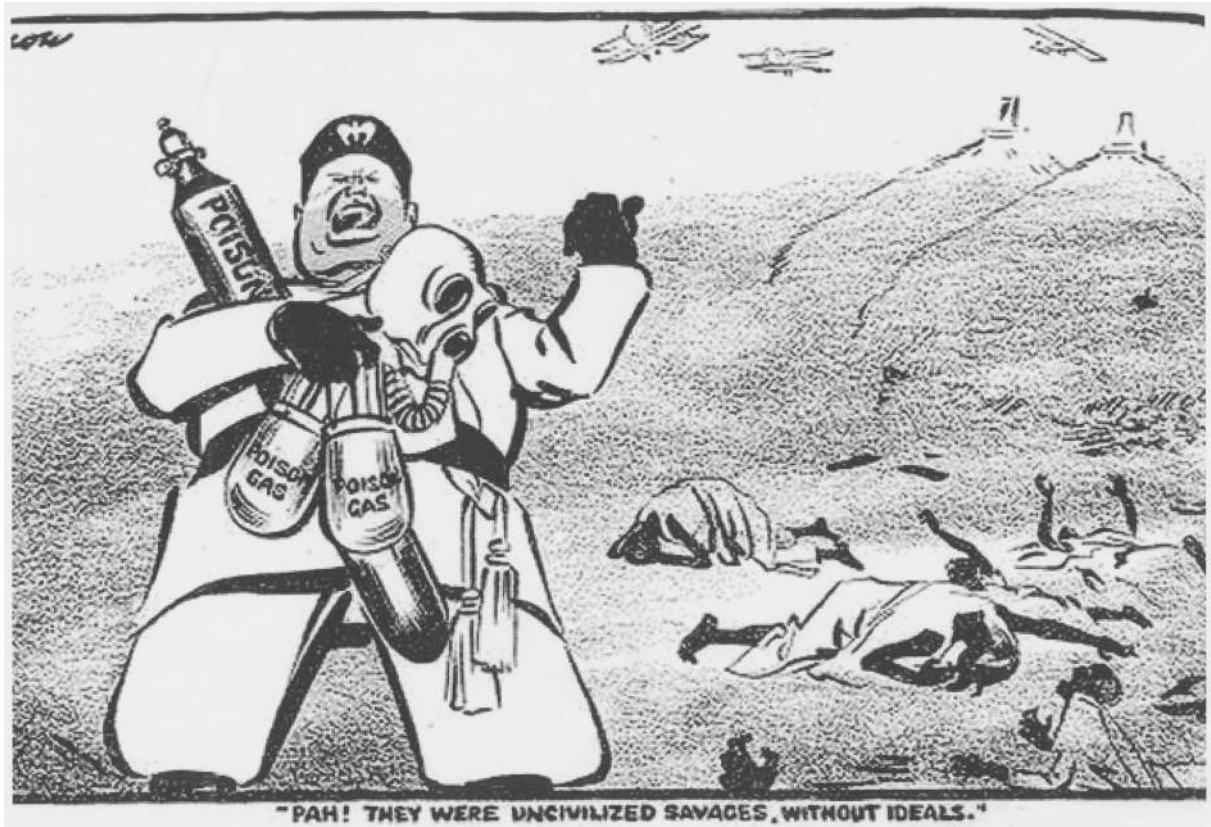
A cartoon published in an English newspaper, 3 April 1936.